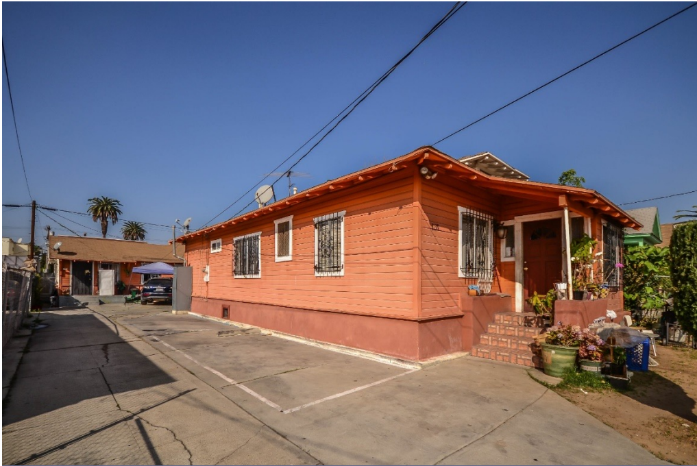
1139 - 1141 S Kingsley, Los Angeles, CA 90006