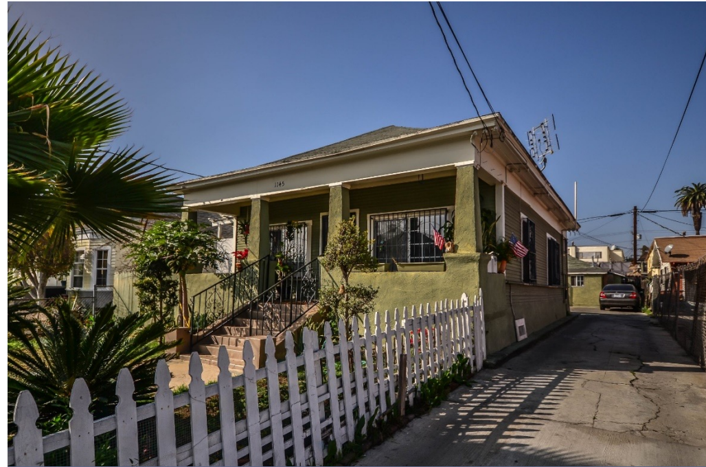
1145 S Kingsley, Los Angeles, CA 90006